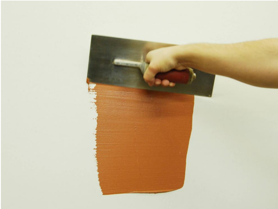
Apply the first coat of Alto™.