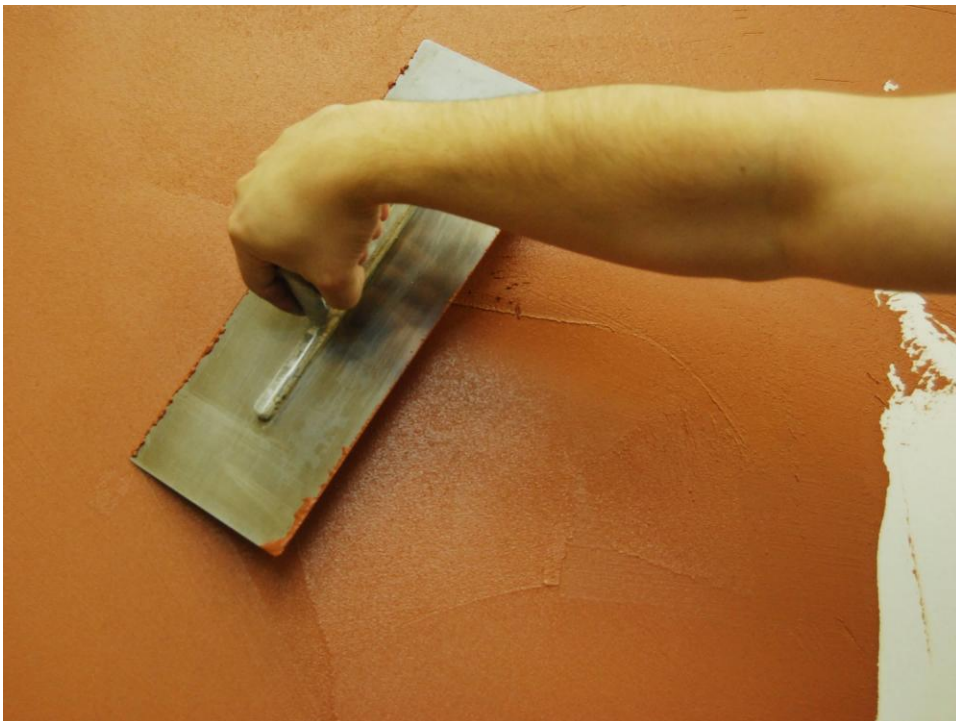
Apply this coat in random, decorative trowel strokes.