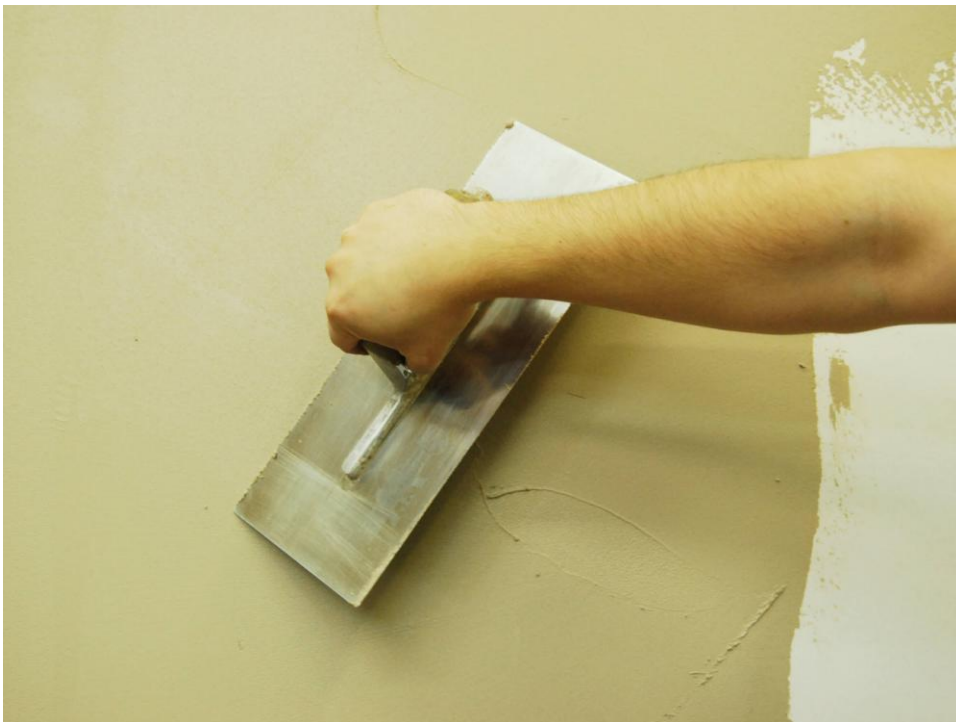
Apply this coat using random, decorative trowel strokes.