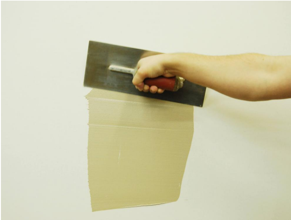
Apply the first coat of Alto™.