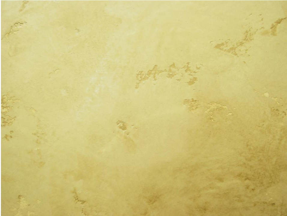
Finished Alto Tuscany™ with Colorwash.